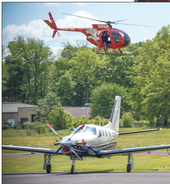
Dino Peros heads up to skydive.