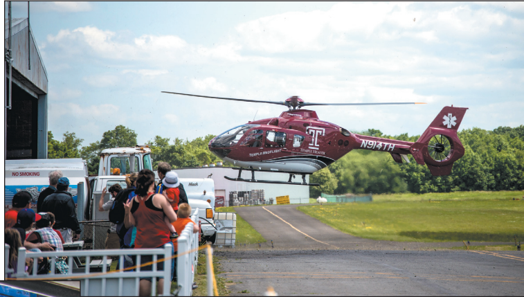
The Temple Medical Transport Team arrives at the airport.