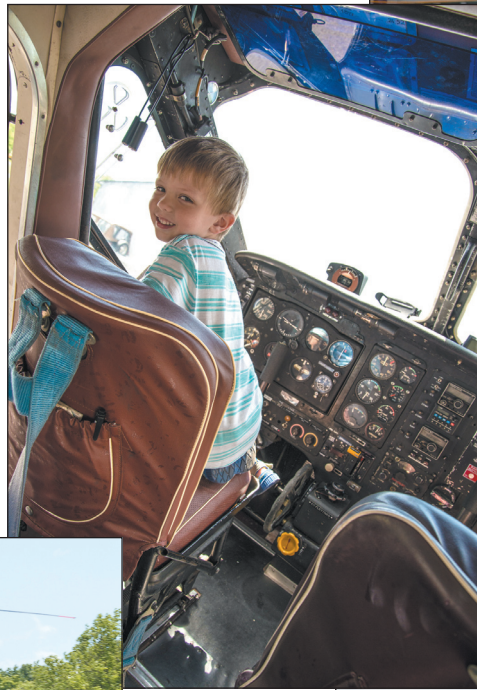
Jude Wetherbee in the cockpit of a 1955 French-made plane named Le Broussand.